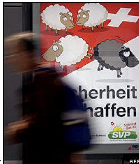
The controversial poster bears the slogan "For more security"