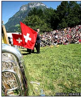
Right-wing parties fear Swiss traditions are under attack

"It is entirely contrary to Switzerland's humanitarian tradition, and really not the way we should do things."